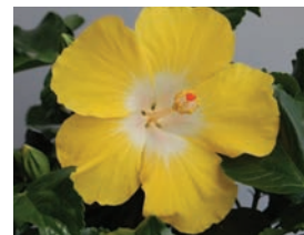
NEW! Bonaire Wind (USPPAF) A pastel yellow with a white throat and 5 to 5½" flowers. The best yellow that can be used for 4½", 6" or larger pots.