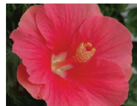
NEW! San Andreas Wind (USPPAF) A dark pink with a small white throat. Color is darker than Somoa Wind. Flowers are approximately 5¼". Recommended for 4½", 6" or larger pots.