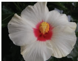
NEW! Tobago Wind (USPPAF) White with a touch of cream and a dark pink throat. Its vigor only makes it suitable for 6" or larger pots.