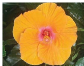
Montego Wind (USPP #17952) Orange blooms with a pink band and a pink throat. Large blooms are 5½ to 6". Recommended for 4½", 6" or larger pots.