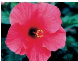
Pink Versicolor A long-time favorite. Bright pink with a dark pink throat. Recommended for 4½", 6" or larger pots.