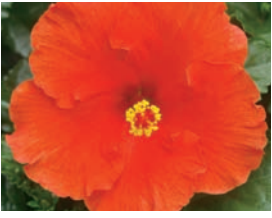
Baja Breeze (USPP #17607)

A dark red with a ruffled petal margin. Recommended for 4½", 6" or larger pots. (This variety will be discontinued in June, 2012.)