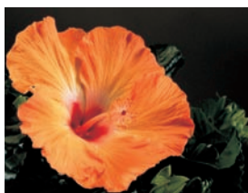
Mandarin Wind (USPPAF) Slightly darker orange than Carolina Breeze with a pink band throat. Flowers are very large at 6 to 6¾". Recommended for 6" or larger pots.