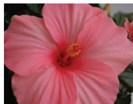
NEW! Somoa Wind (USPPAF) A dark pink with a small dark pink throat. Large 5½" blooms. Smaller foliage and a more compact habit. Recommended for 4½", 6" or larger pots.