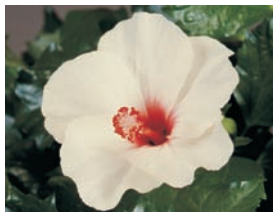
Cool Wind (USPP #12887) A pure white with a pink throat and large 4¾ to 5¼" flowers. Recommended for 4½", 6" or larger pots.