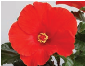
NEW! Tortuga Wind (USPPAF)

Bright red with a slightly darker red throat. Large 5½" flowers. Recommended for 4½", 6" or larger pots.