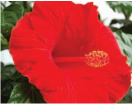
NEW! Tonga Wind (USPPAF)

A scarlet red with a light yellow and burgundy star in the throat. 5 to 5¾" flowers. Recommended for 4½", 6" or larger pots.