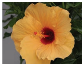
NEW! Aruba Wind (USPPAF) A yellow-orange flower with a burgundy throat. Flowers are approximately 5". Recommended for 6" or larger pots.