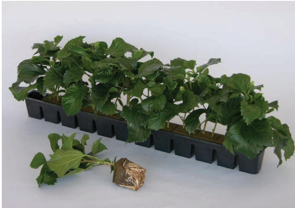
Pictured: Cool Wind

Ideal for in-home décor or on the patio... anywhere a splash of color is desired. Not hardy outdoors at temperatures below 30°F.)