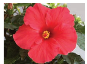
NEW! Antigua Wind (USPPAF) A brilliant red color with a deep red throat. Large 5" flowers. Buds up early and controllable with PGRs. Recommended for 4½", 6" or larger pots.