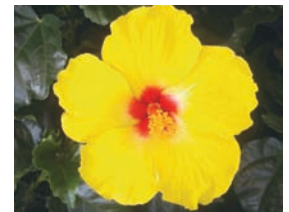
Sunny Wind (USPP #17623) A dark, clear yellow with a red throat. Color is darker than Bonaire Wind and a clearer yellow than Aruba Wind. Large 6 to 6½" flowers. Recommended for 6" or larger pots.