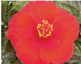
NEW! Trinidad Wind (USPPAF)

Dark red with a darker red throat. Flowers are somewhat smaller than Tonga Wind, but has better self-branching. Recommended for 4½", 6" or larger pots.