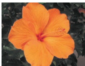
Carolina Breeze (USPP #11779) A bright orange with 4¾ to 5¼" flowers. Recommended for 4½", 6" or larger pots.