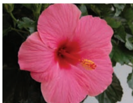
NEW! Cayman Wind (USPPAF) A showy lavender pink with a red throat and large 5½" flowers. Good self-branching. Recommended for 6" or larger pots.