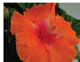
NEW! Nassau Wind (USPPAF) A dark but bright orange with large 5 to 5¼" flowers. More compact habit makes it suitable for 4½" pots. Recommended for 4½", 6" or larger pots.