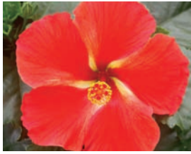
Starry Wind (USPP #17491)

An all-time favorite. Bright red 6" + flowers. Recommended for 6" or larger pots.